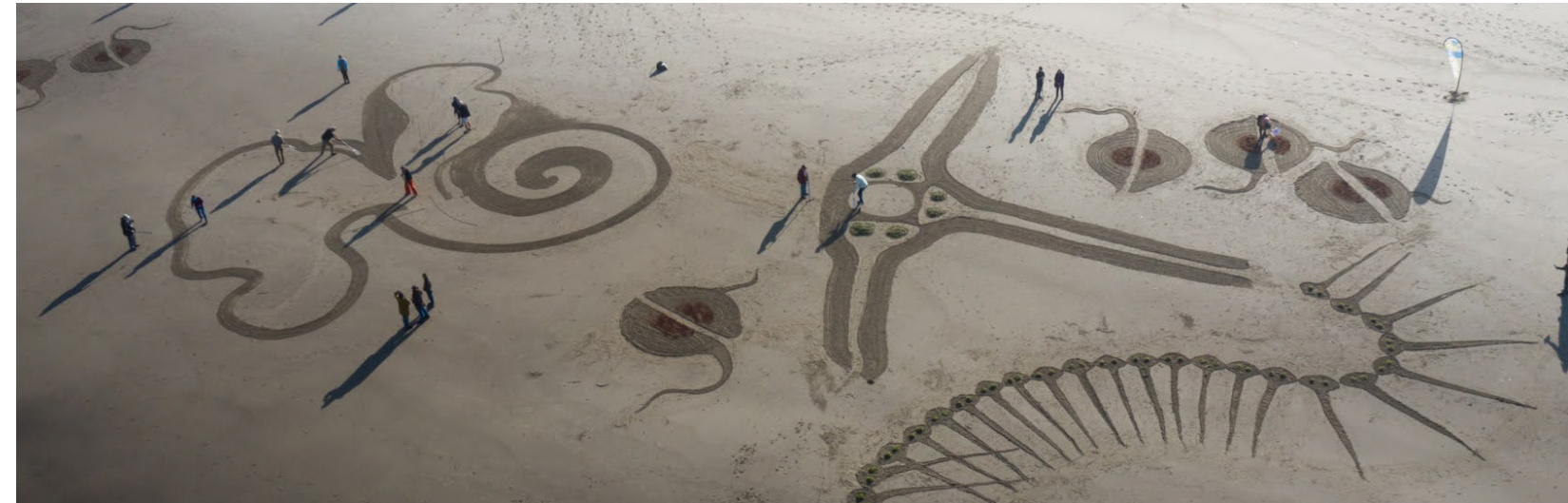
Overhead view of sand art designs by participants from the fall 4CAST Summit.