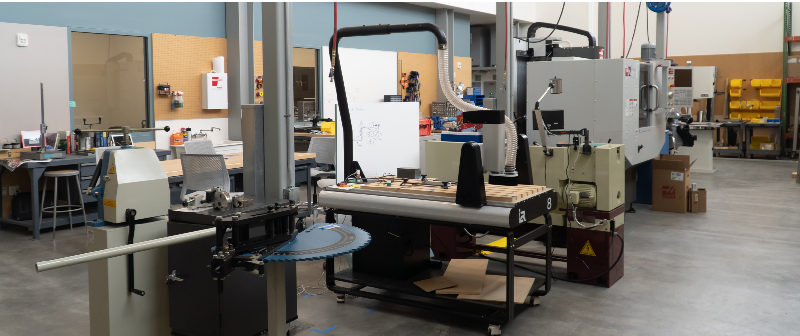
The main shop floor sits in the center of the lab outfitted with a manual mill and lathe as well as a computerized numerical controlled (CNC) mill. Additional equipment such as the CNC router seen to the left of the image will serve as a shop tool and learning tool for gaining skill sets in programming manufacturing equipment.

As the Gladys Valley Marine Studies Building has come to life over the past term so has the Innovation Lab (iLab) that sits within. The Hatfield Marine Science Center iLab embodies the full progression of an idea, from design in the computer lab to presentation in the studio. Serving as a resource for the Hatfield community and beyond, the iLab houses the necessary equipment and training resource to complete innovative projects. Within the 2,500 sq ft lab there are dedicated spaces for traditional machining, 3D printing, welding, electronics, computer design, multi-media, and an artist studio. Each area has been outfitted with a suite of tools that allow for introductory level work as well as cutting edge professional work. The iLab sits as a space for learning and creating for any marine focused design effort and works to pair learning experiences with projects to provide greater access to unique hands-on experiences.