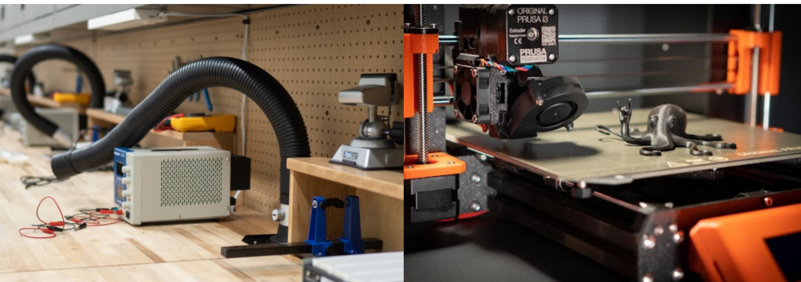
(Left) Work stations are setup on the electronics work bench that is outfitted with the necessary equipment for performing design and development or troubleshooting of electronics. (Right) There is a printing cabinet filled with Prusa filament style printers. These printers will be used for creating prototype components and are part of the additive manufacturing capabilities of the iLab.

As the Gladys Valley Marine Studies Building has come to life over the past term so has the Innovation Lab (iLab) that sits within. The Hatfield Marine Science Center iLab embodies the full progression of an idea, from design in the computer lab to presentation in the studio. Serving as a resource for the Hatfield community and beyond, the iLab houses the necessary equipment and training resource to complete innovative projects. Within the 2,500 sq ft lab there are dedicated spaces for traditional machining, 3D printing, welding, electronics, computer design, multi-media, and an artist studio. Each area has been outfitted with a suite of tools that allow for introductory level work as well as cutting edge professional work. The iLab sits as a space for learning and creating for any marine focused design effort and works to pair learning experiences with projects to provide greater access to unique hands-on experiences.