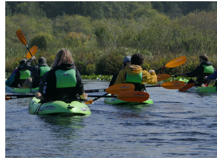
Ocean11 Leadership Team members on a kayaking trip as part of their fall retreat.

They're baaaack! Ocean11 students were back on campus in full-force this Fall, eager to dive into every activity. Students were ready to interact in person with one another. We had almost double the participation, enthusiasm and energy at our events. Our new Student Leadership Team did an incredible job of creating and facilitating a variety of activities such as a Beach Cleanup, Newport Behind-the-Scenes Overnight, selling metal straws, Ocean Observing Center Tour, Tailgates (Go Beavs!), Ocean-themed Pumpkin Carving and Bingo Nights, and a big Holiday Party to top off the term. Ocean11 meets monthly as a large group and then its five committees plan the rest of the term's calendar (Community Outreach, Field Trips, Next Gen Outreach, Research & Learning Opportunities, and Social). Ocean11 is definitely back and riding a big wave of momentum into 2022!