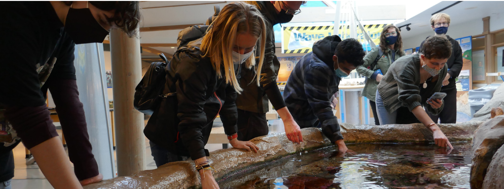
Undergraduate liberal arts Marine Studies students on a fall trip to the Oregon Sea Grant Hatfield Visitor Center at the touch pool.